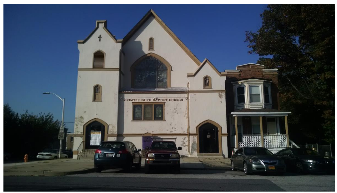
The façade of the church and rectory.